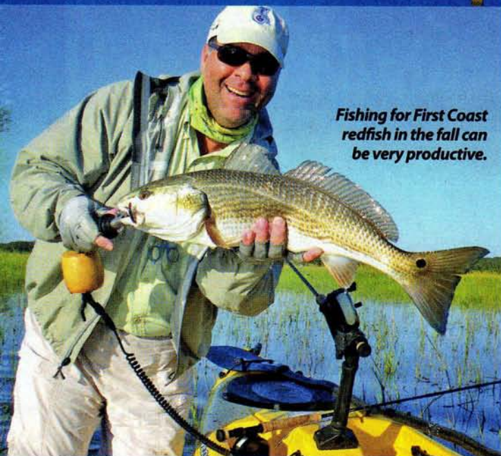
Fishing for First Coast redfish in the fall can be very productive.

whose favorite feeding game is to prowl the extreme shallow flats in search of a meal. You'll see them cruising with their back and tails out of the waters, swimming with a slow, serpentine motion during low tidal phases. Then you can move on to the high tide flooded grass flats for more tails in the air. I've seen most newcomers here experience a serious case of buck fever. So be prepared. It's not all sight casting. Blind casting toward structure is also productive and accounts for about 25 percent of my time out there, depending on the daily fish behaviors and patterns.