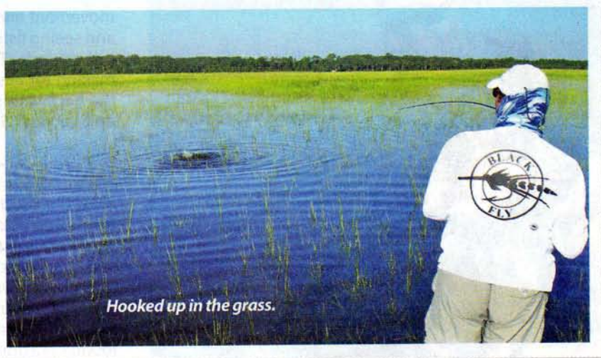
Hooked up in the grass.

The atmosphere is "wild". While fishing, you often hear the snapping pop sounds of exposed oyster bars 'breathing' through the air and then the alarming squawk of a marsh hen in the cord grass. It's often like being on a safari. You throw a blind cast in one direction into a deep